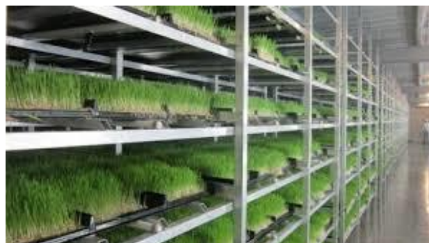
Picture 3. Hydroponically grown barley.

Hydroponic feed, which involves the cultivation of plants without soil in a nutrient-rich water solution, has the potential to influence cow milk yield and milk quality in several ways [37]. While this approach is not typically used in the dairy industry, it can indirectly impact milk production and quality through changes (Table 2) in animal nutrition and overall herd health [27]. Hydroponic feed can be carefully controlled to provide a consistent and nutritionally balanced diet for cows. This precision in nutrient provision can lead to improved cow health and performance, which may positively impact milk yield and quality. A well-balanced diet can provide the necessary energy, protein, and other nutrients for optimal milk production [38]. Hydroponically grown forage, such as barley (Picture 3) or wheat grass, can be highly nutritious and free from contaminants often found in traditional pasture or stored forage. This cleaner and more nutritious forage can enhance the cow's diet, potentially leading to increased milk production and improved milk quality. Hydroponic systems offer a controlled environment where factors such as temperature, humidity, and light can be optimized for plant growth. These factors can indirectly affect cow comfort and health, potentially reducing stress and promoting milk production. Hydroponically grown crops are less likely to be contaminated with soil-borne pathogens [39], pesticides [40], mycotoxins [41] or heavy metals [42].